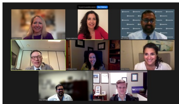
Screenshot from the October 2023 Webinar Sponsored by Terumo Aortic

Video Recordings of each webinar can be found on the MVSS You Tube Channel .