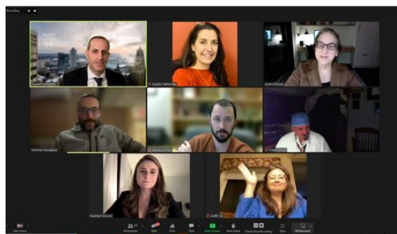
Screenshot from the January 2023 Webinar Complex Open, Endovascular and Hybrid Aortic Repair Sponsored by Terumo Aortic

10/26/2022 Aortic Arch Management (WL Gore)